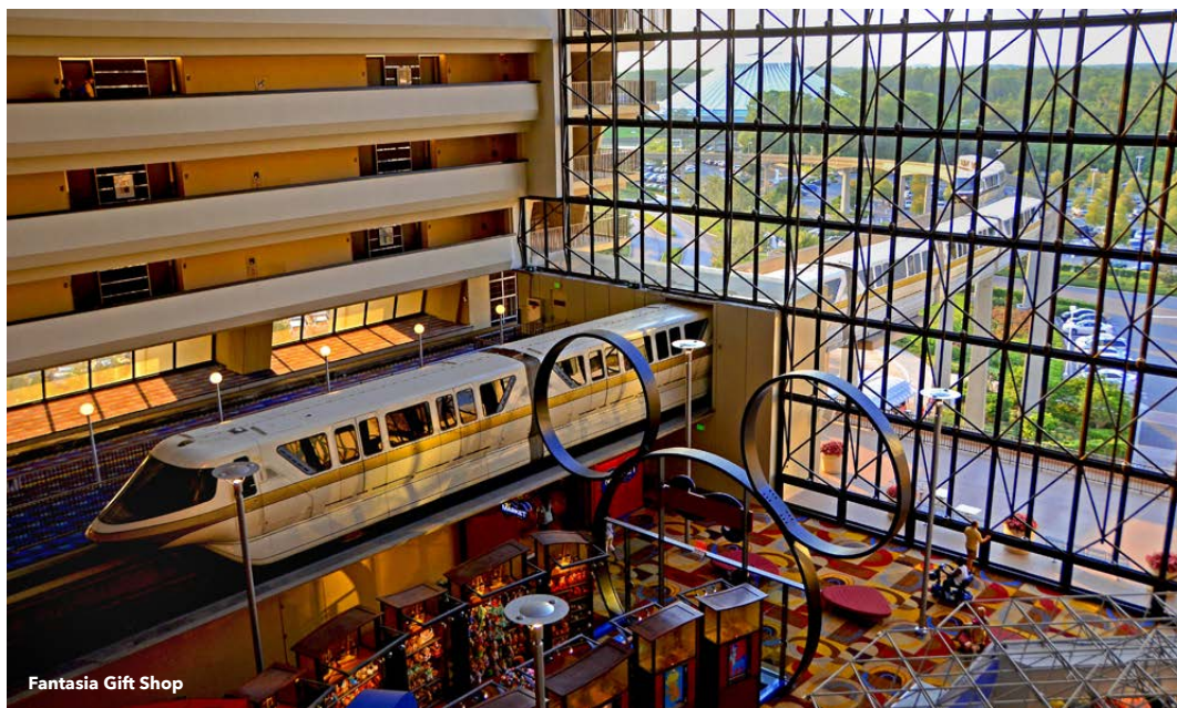
Fantasia Gift Shop