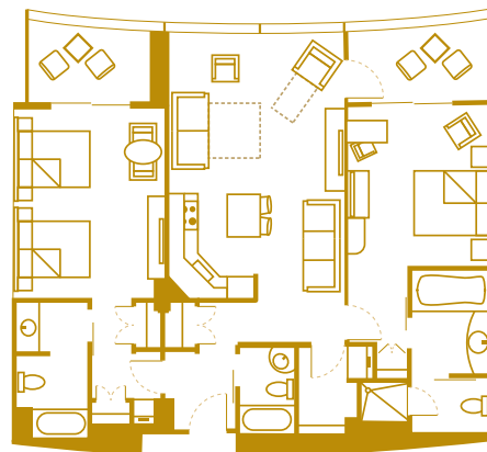
Typical 2-Bedroom Villa , 1,152 sq. ft. Accommodates up to nine Guests plus one child under age 3 in a crib.