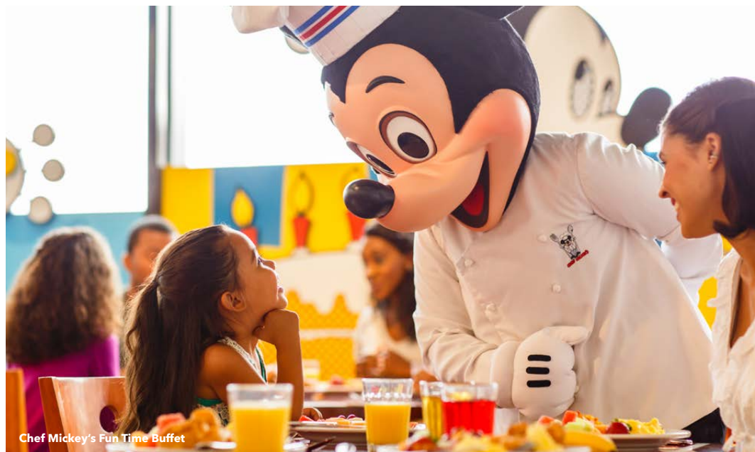
Chef Mickey's Fun Time Buffet