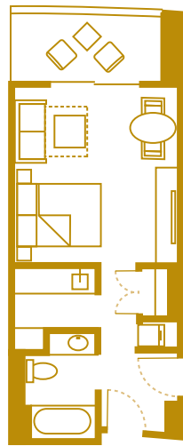
Typical Deluxe Studio , 339 sq. ft. Accommodates up to four Guests plus one child under age 3 in a crib.