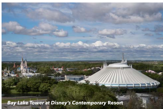
Bay Lake Tower at Disney's Contemporary Resort