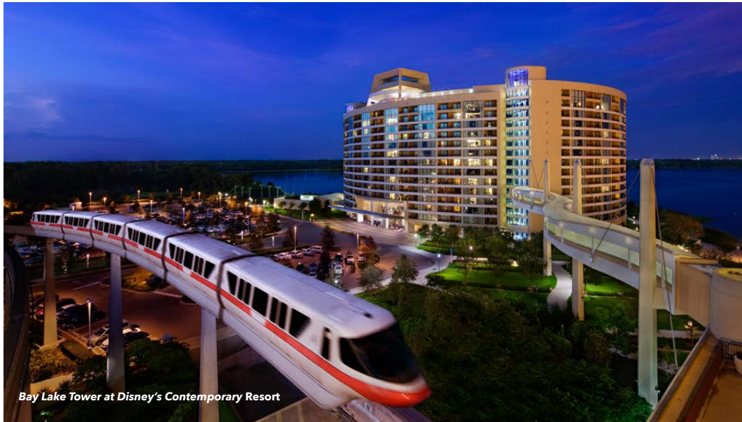
Bay Lake Tower at Disney's Contemporary Resort