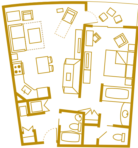
Typical 1-Bedroom Villa , 803 sq. ft. Accommodates up to five Guests plus one child under age 3 in a crib.