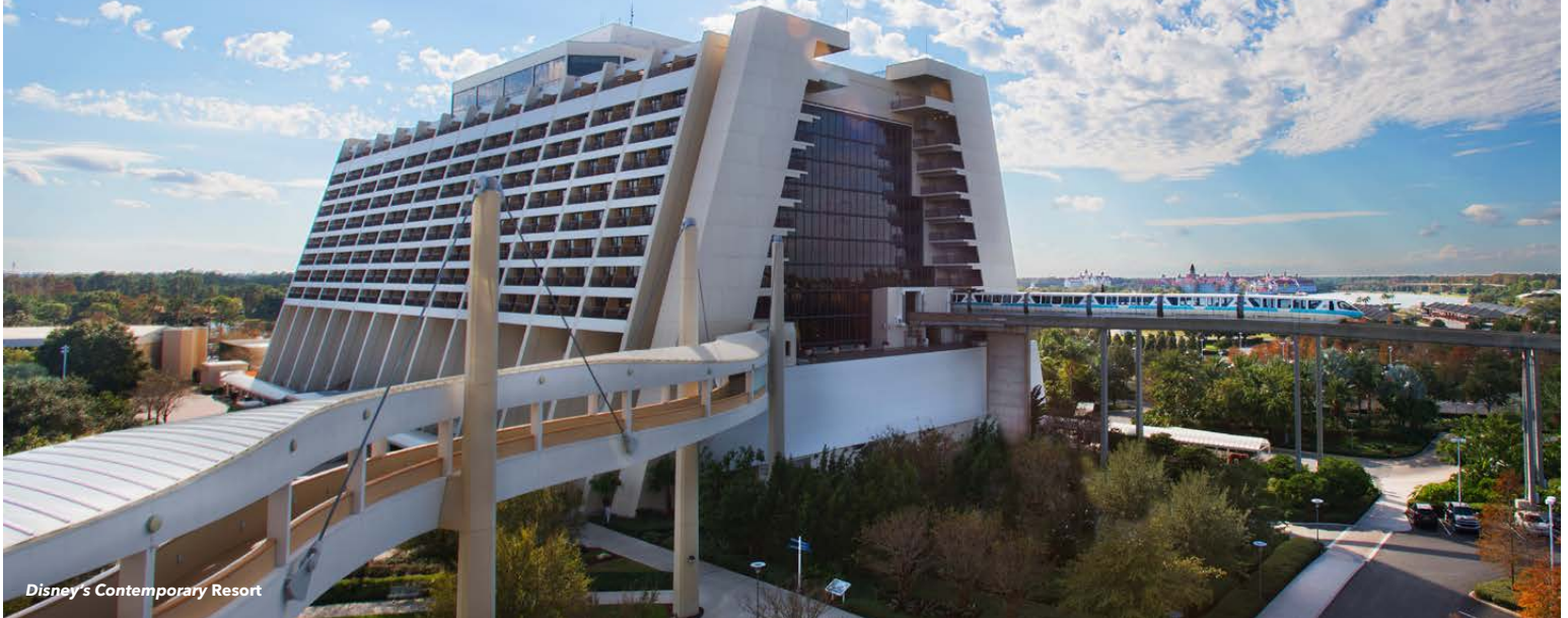
Disney's Contemporary Resort

Retreat to this ultra-modern Disney Resort hotel and discover award-winning dining, spectacular views and dazzling pools. Whether you're staying in the iconic A-frame Contemporary tower or the nearby Garden Wing, you can walk to Magic Kingdom ® Park main gate or catch the monorail as it breezes through the tower. Inside a 90-foot-tall mural by Disney Legend Mary Blair—responsible for the distinct look and feel of the "it's a small world"® attraction—celebrates the Grand Canyon and the American Southwest.